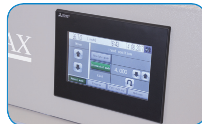
Touchscreen control panel allows for programming up to 100 jobs