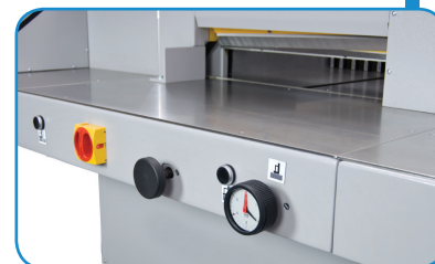
Two-button operation, fine-tune knob, adjustable hydraulic pressure gauge